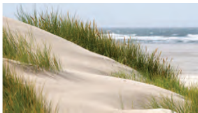
Floreal, Blankenberge, Belgium

The Belgian Association for Sleep research and Sleep medicine (BASS) announces the next edition of the International Sleep Medicine Course (ISMC) .